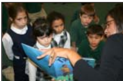
Children at Peace Academy, a private school run by the Islamic Society of Tulsa, read Twister during a disaster preparedness workshop.